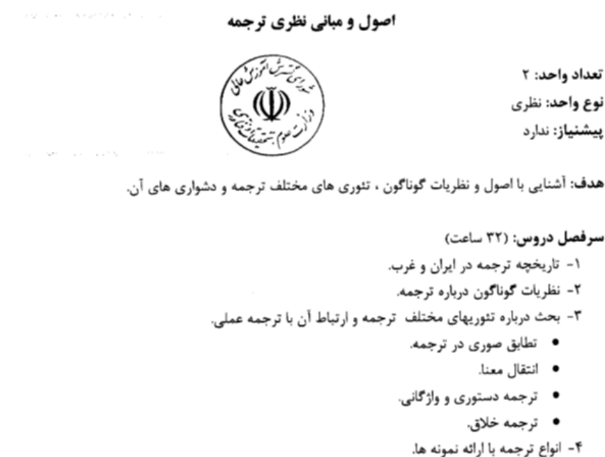
Figure 1: A Sample of Course Objectives of Translation Curriculum

The purpose of 'The Theoretical Principles and Basics of Translation' is to acquaint students with the basic theoretical principles of translation. In the first step, the objectives (expressed through verbs/gerunds) were identified and codified based on the BRT. For example, 'to get acquaintance with principles, different arguments, various translation theories, and the presupposed difficulties' is codified as B2 ( understand/conceptual ) because instructors have to explain translation theories, models, and structures. Since this objective deals with explaining the knowledge of theories, classifications, and categories, it is codified as B2. The second objective, 'discussing various translation theories and their relationship with practical translation' is codified as B5 ( evaluate/conceptual ). The reason it is codified as B5 is that the objective focuses on reviewing and assessing translation theories and concepts in relation to values, efficacy, and viability as well as discussing their connections to real translation, case exemplification, the conveyance of meaning, grammatical and lexical conversion, and creative translation. As it can be seen in figure 1, the objectives stated in number 1, 2, and 4 do not have any verb or gerund to clarify the intended objectives. Therefore, they had been ignored.