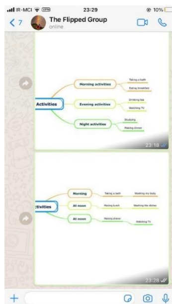
Figure 3: An Example of Mind Map shared by the participants in the Introverted Flipped Class

In both flipped classes in WhatsApp groups, the participants accessed the topic of the speaking activity at the group and were asked to prepare a digital mind map for it and share in the group. This is opposite to the traditional groups which were introduced new topic at the traditional classrooms, and drew their mind maps at the class. In the flipped classes, the participants received the speaking topics in the group and then were asked to think about the topic and draw mind maps using Mindomo software and share their mind maps in their assigned group before the class. In the following session, they attended the traditional classroom and talked about the designated topic along with some background knowledge. After the treatment sessions, all the participants took part in the speaking post-test and their interviews were graded by two raters and the groups were then compared.