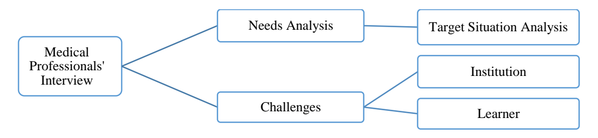
Figure 3 Medical Professionals' Interview Outline

ISSN: 2476-3187 IJEAP, 2023, 12(2), 49-68 (Previously Published under the Title: Maritime English Journal)